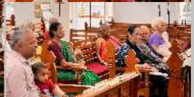
Senior Citizens Fellowship - April 6