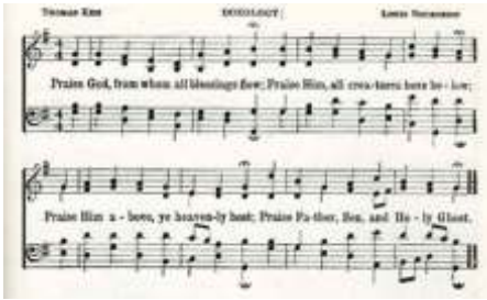
Thomas Ken 1637-1711