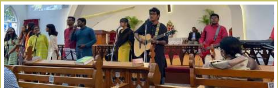
MYF Sunday 24.07.2022