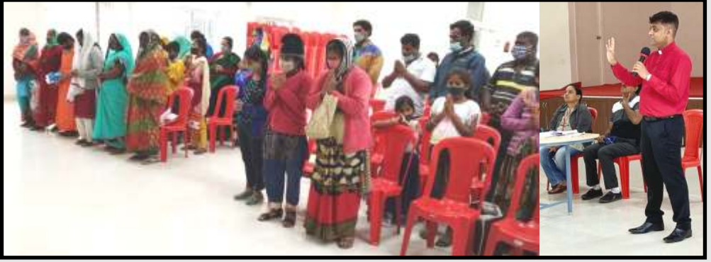
IMC Poor Fund Committee - members, Distributed Provisions for 50 slum people from Kogilur and Bhogalur on 21/11/2021